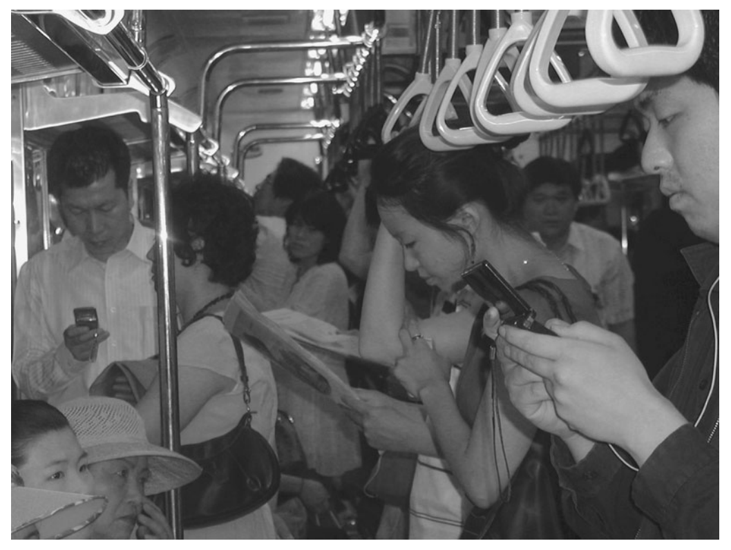
Blog Pic 1.2 We can communicate and connect from anywhere.