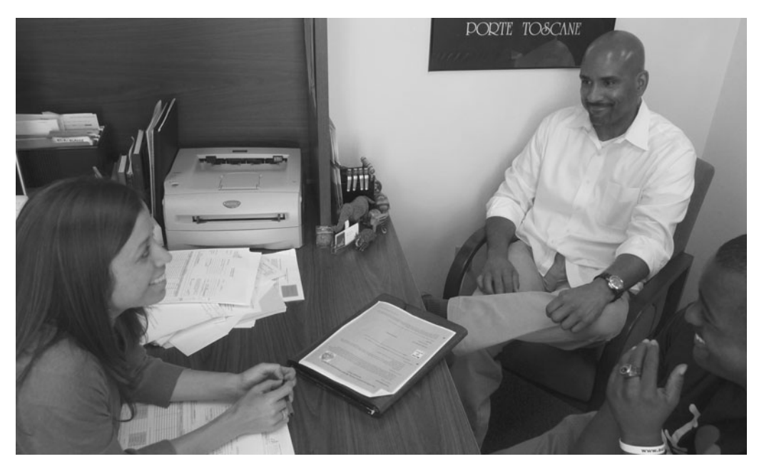
Blog Pic 1.1 Workplace diversity has become an inevitable part of our daily life.

Second, we are moving at an accelerated pace with increased foreign-born diversity in the nation. According